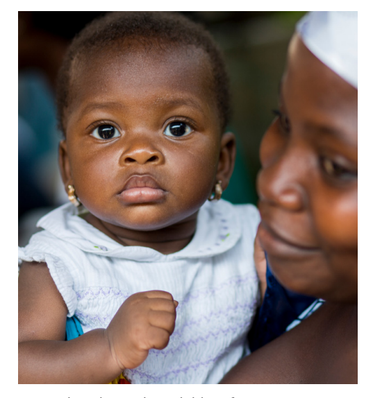
Mothers bring their children for vaccinations and health checks in Accra, Ghana on January 9, 2014.

A key reason that nearly all rotavirus deaths occur in less developed countries—despite the fact that the disease is common in rich and poor countries alike—is the lack of timely access to health care in many places. In addition, rotavirus can be more severe in low-income countries due to frequent concurrent infections, malnutrition, and other factors. Year-round transmission due to climatic factors may also contribute to the much higher toll of the disease among children in low-income countries.<sup>(20,21)</sup>