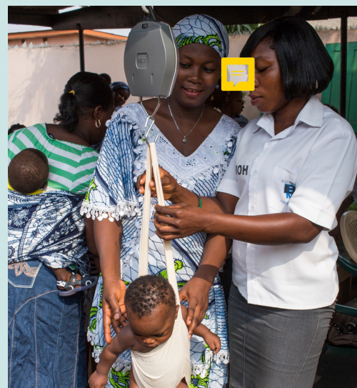
Mothers bring their children for vaccinations and health checks in Accra, Ghana.

Preventing diarrhea through interventions such as improved water, sanitation, and zinc supplementation, while reducing the duration and severity of diarrhea—for instance, through oral rehydration therapy, zinc treatment, and antibiotic therapy for bacterial enteric infections—can therefore have a “multiplier effect” in areas with high rates of malnutrition and diarrheal disease by also preventing pneumonia, the number one cause of death in children under 5 worldwide.