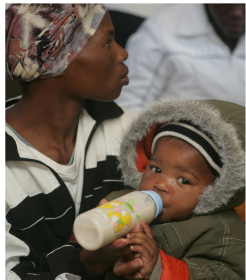
Woman holding an infant in South Africa.

How does stunting or a high burden of diarrhea in early childhood result in less schooling and poorer performance in school? One possibility is that chronic malnutrition—manifested by stunting—results in deficiencies of nutrients critical to brain development. Even more so than length and weight measures, the MAL-ED study found that head circumference measures were most linked with cognitive scores at age 2. (15) Repeat diarrheal infections—by damaging the wall of the intestine and by causing chronic inflammation—can also reduce the ability of the gut to absorb critical nutrients, such as zinc, iron, and fatty acids, as well as micronutrients that are crucial to the development of the brain during the first two critical years of life. (16-18) This may explain why some studies showed that diarrhea alone—even without malnutrition—affect performance on intelligence tests.